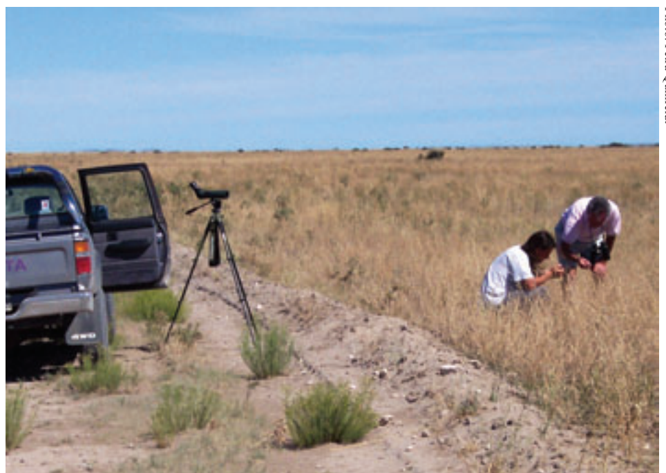
Protecting the parrot colony requires a good knowledge of the foraging needs of this population and the identification and protection of the feeding areas that support it.

Video observations in the 2001-02 breeding season indicated that breeding pairs of Burrowing Parrots spend the night with their young in the nest during the nestling period. These observations were confirmed by direct inspection of nests in the study sector during the late evening in the 2003-04 breeding season. Thus, Burrowing Parrots roosting outside of nests during the nestling period were not attending nestlings. Between the end of November and the end of December, flocks of Burrowing Parrots spend the night in the village of El C6ndor, roosting mainly on power lines. The village and its peripheral streets are the only roosting place associated with the colony in a 30 km (18 mi) radius. On two nights in December 2003 a team of six trained people, in two vehicles, counted all Burrowing Parrots in the village at dusk. The counts were done