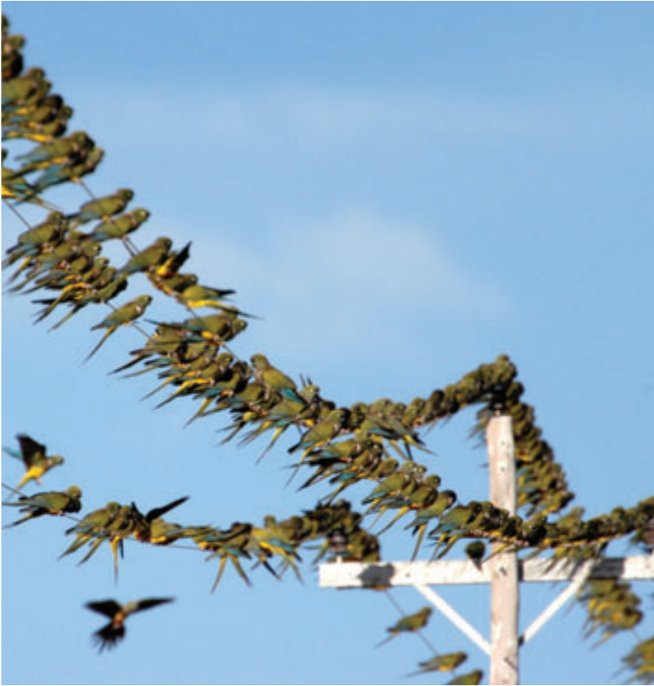
Thousands of Burrowing Parrots line the power lines in the village of El Cóndor, Patagonia, Argentina to roost. Since breeding birds spend the night with their chicks in the nest burrows, these birds are all non-breeders associated with the colony.

after the late broods hatched and well before the first sightings of fledglings outside their burrows. Thus all the counted parrots were close to the beginning of their second year of life or older.